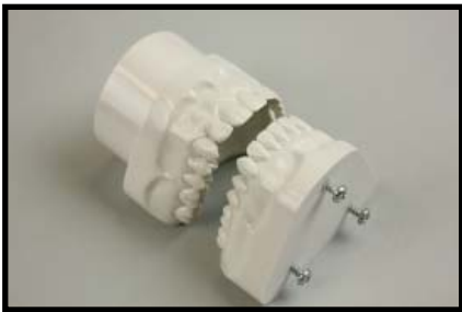
2605 EM•Bio-Esthetic Study Models (Class I)

The “Introduction to Occlusal Anatomy” waxing manual will help develop an understanding of why the occlusal surfaces of the teeth have certain shapes by relating opposing teeth to each other for optimal chewing efficiency and stability.