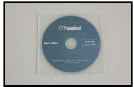
5053 EM• Basic Articulator System CD