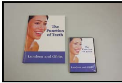
5954 EM•The Function of Teeth